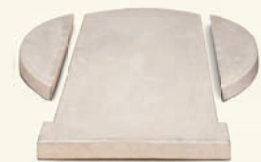
CBO-750 Hearth Insert

Modeled after the great Neapolitan ovens of Italy, the 750 model has a larger cooking surface and is the ultimate expression of wood fired cooking. Now available with a multi-piece hearth, installation of this high-performance oven is easier than ever.