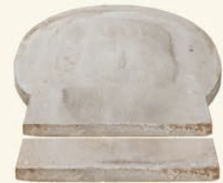
CBO-500 Hearth Insert

Our 500 model oven offers the Chicago Brick Oven cooking experience in a compact footprint. It's an easy way to deliver a better outdoor experience in a simple, value-driven package.